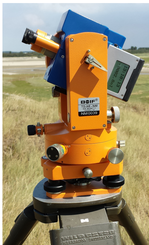
Figure 2. The WIDIF Diflux theodolite packs fluxgate sensor and electronics as well as GPS receiver and a battery on the telescope.

Such an add-on has been designed and manufactured and is displayed in Fig. 3. The sun shot add-on is clamped on the telescope at the ocular end. An articulated cover holding the photocells can be opened so as to leave the ocular accessible for normal telescope pointing with the eye. The cover holds two photocells plus some analogue electronics in front of the ocular lens (when closed) so as to catch the light passing through the telescope and transform it into voltages. The add-on generates “SUM” and “DIFFerence” of the two pho-