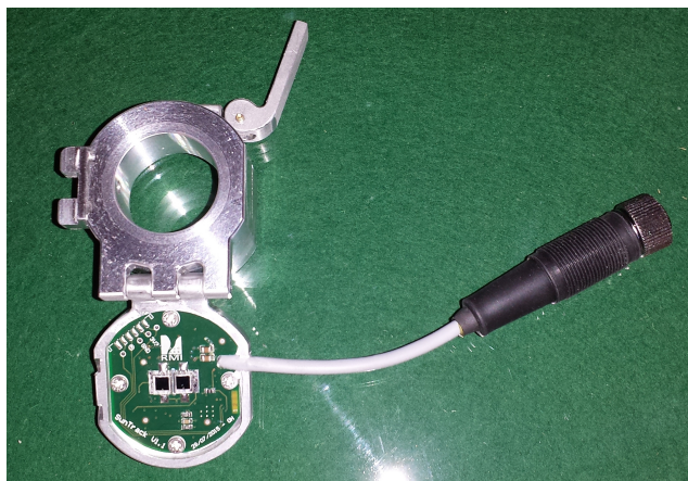
Figure 3. The sun shot add-on is a small mechatronic device fitted to the WIDIF theodolite's telescope ocular and able to precisely determine the sun's direction. Two black photocells serving this purpose can be seen side-by-side on the printed circuit board.