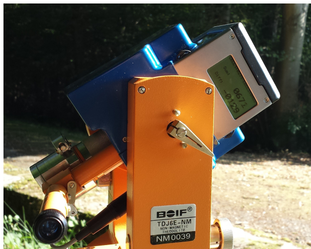
Figure 5. The photocells sum and difference voltages are displayed on the WIDIF LCD's so as to ascertain the way the cells are illuminated.

The procedure for performing a sun shot uses the apparent horizontal motion of the sun to move its sun rays through the telescope. The focused rays will sweep over both cells and stop the clock timer when the difference between the two photocell voltages is zero. But a zero will also exist if no light at all falls on the photocells. Therefore we inspect also the SUM of the photocell voltages.