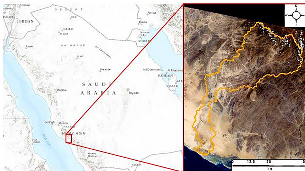
Figure 1. Location of the study area (Elhag, 2016).