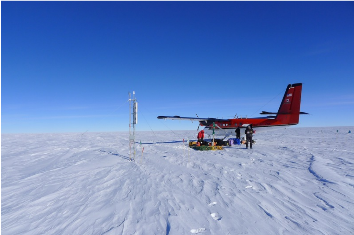
Figure 1. Twin Otter airplane next to the AAL-PIP system at PG2 (84.42 S, 57.96 E). The extreme environment and remote nature of the AAL-PIP sites makes in-person maintenance very difficult.

Deployment and maintenance visits to the Antarctic AAL-PIPs are challenging. For example, in order to install the instrument platforms, two trips were required for each field site, one for the equipment cargo and another for the 3 member field team to put in. For several of the sites, the distance required the establishment of fuel caches at intermediate locations and at the site. Weather and visibility present additional complications. With the high demand on aircraft and the limited time that flying conditions are sufficient, it is sometimes the case that only one station can be visited during a particular summer field season. It is also noteworthy, that if a problem is detected at a station that requires a maintenance trip, bringing the equipment back for diagnosis and repair and then redeployment generally requires a year since it is only possible to visit during the summer field season.